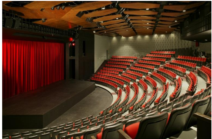
The Centennial Theatre with its extended thrust

The Centennial Theatre features a counter-weighted stage elevator that can be used as a thrust, when needed. Please note that the stage elevator may not run during a performance and must be parked at audience or stage level prior to any presentation.